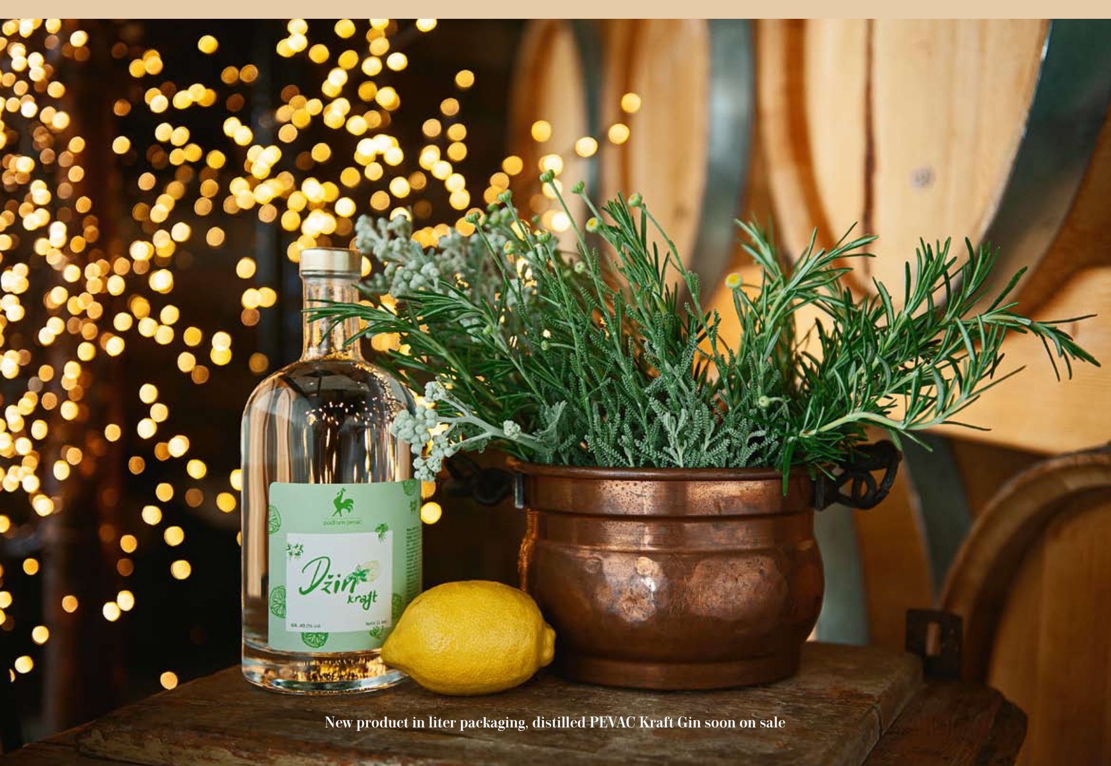
New product in liter packaging, distilled PEVAC Kraft Gin soon on sale