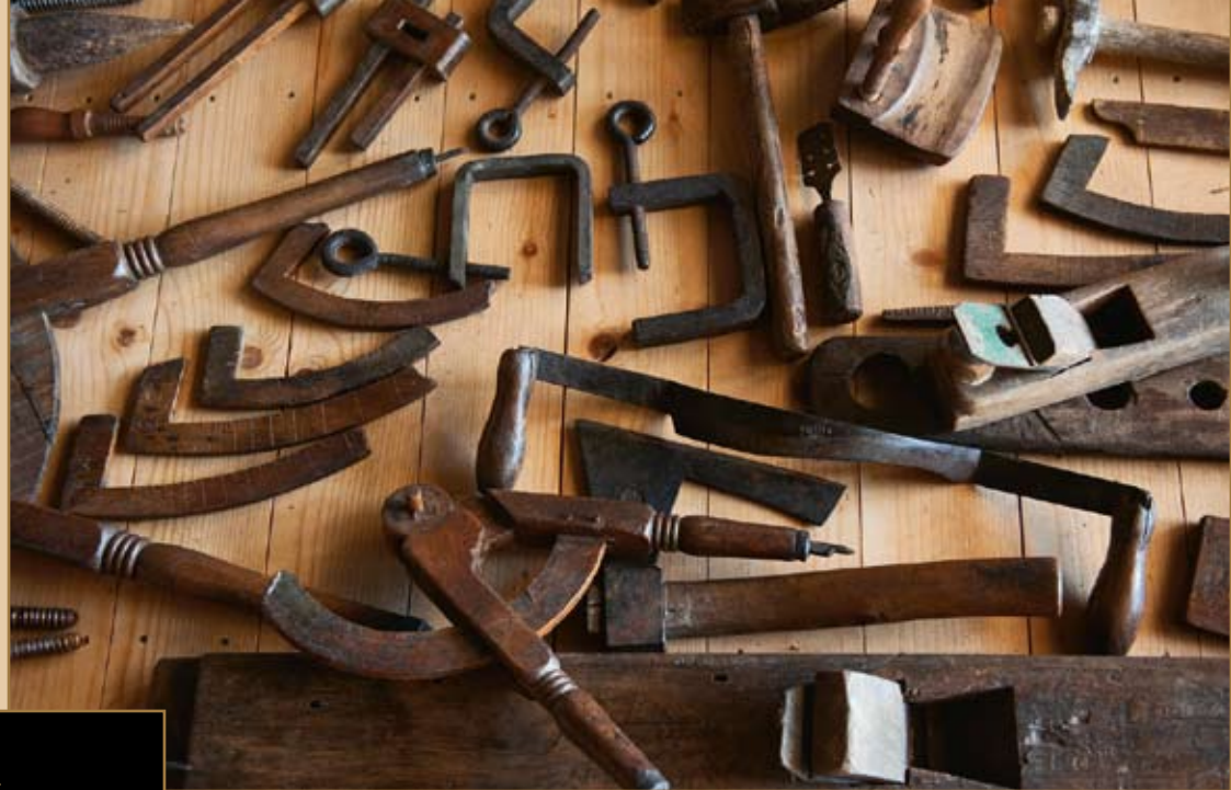
Great-grandfather Veličko's barrel making tool, over a hundred years old